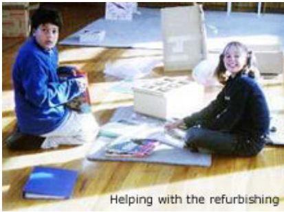
Helping with the refurbishing

As with most pioneering schools the early years were difficult financially and it was only the commitment of the parents and the teachers together to see the school succeed that enabled it to pull through this stage. While